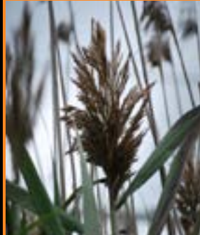
Invasive Species-Phragmites "Phragmites australis"