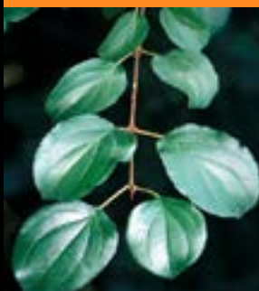
Invasive Species - Common Buckthorn "Rhamnus cathartica"